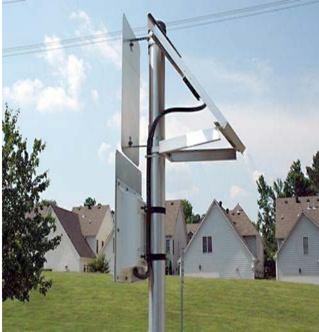
TC-500S Solar powered radar speed sign